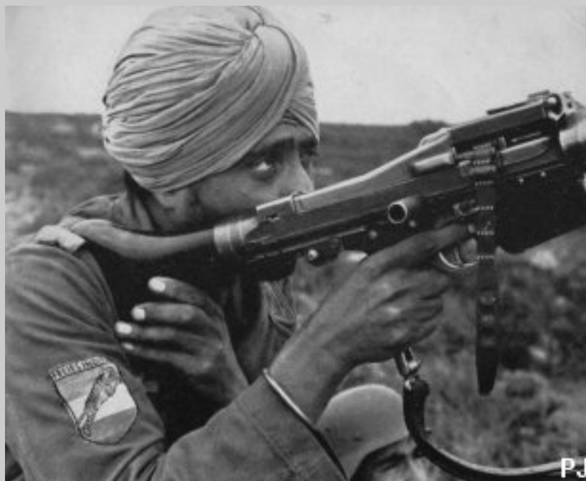
Indian Volunteer Training in NS Germany

NS Germany was home to exiles from many races, including respected individuals such as Subhas Chandra Bose, leader of the Indian National Army, and Mohammed Amin al-Husseini, the Grand Mufti of Jerusalem. Both received significant financial support from the German government and both enthusiastically collaborated with Hitler.