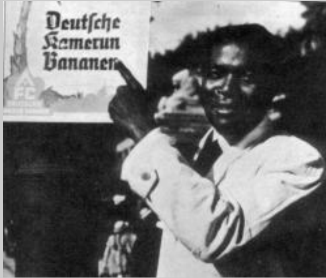
Street Vendor in Berlin, NS Germany

Correctly defined and understood, National-Socialism is an ethnic philosophy which affirms that the different races, the different peoples, which exist are expressions of our human condition, and that these differences, this human diversity, should be treasured in the same way we treasure the diversity of Nature. National-Socialists believe our world would be poorer were these human differences to be destroyed through abstract ideas: through the creation of a socially-engineered cypto-Marxist society.