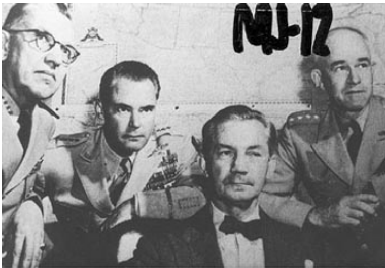
Secretary Forrester (2 nd from right) with other alleged MJ-12 members

The significance of this set of memos is that it shows that in 1952 a project called Majestic was underway and this involved significant support across a wide spectrum of areas that would be expected for something involving UFOs and extraterrestrial life: psychological warfare, covert military operations, civil affairs/military government, logistics, communications, etc. The Joint Chiefs memos corroborate the 1954 Cutler Twining memo involving a project called Majestic-12, and what Smith described as a UFO group headed by Vannevar Bush.