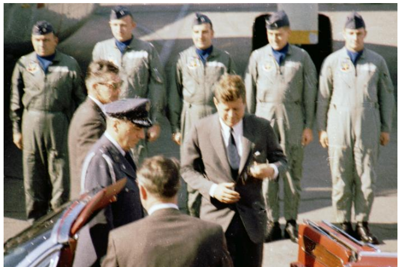
Pres Kennedy arrives at Homestead Air Force Base – 11/25/1962

Whatever the truth of claims that Kennedy had been unofficially briefed about the Roswell UFO crash while a congressman in 1947; personally saw extraterrestrial vehicles and bodies early in his administration; received extraterrestrial messages; or even met with human looking extraterrestrials, there is little doubt that he attempted to gain official