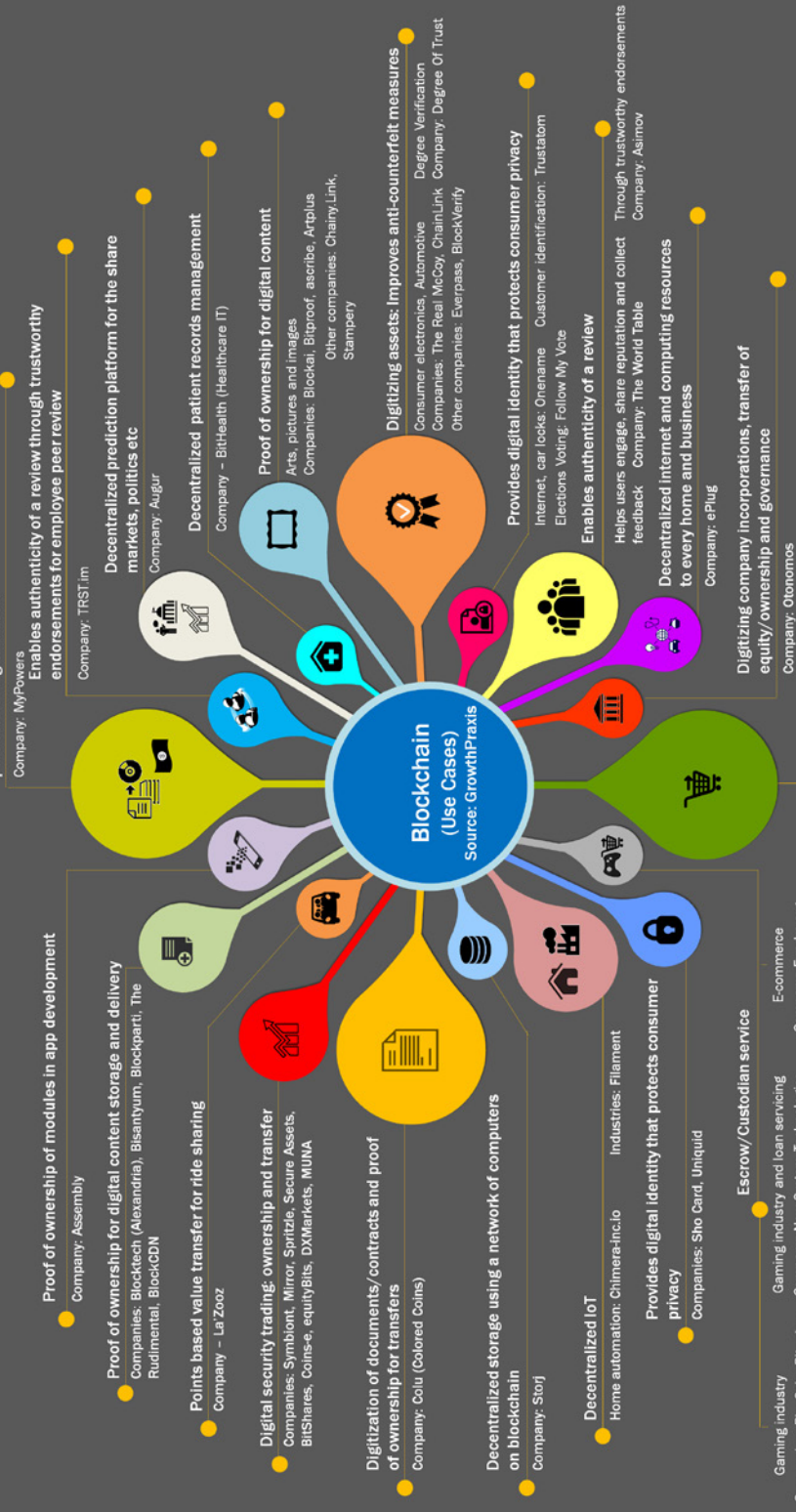
Graphique 1 : Possible uses for the blockchain